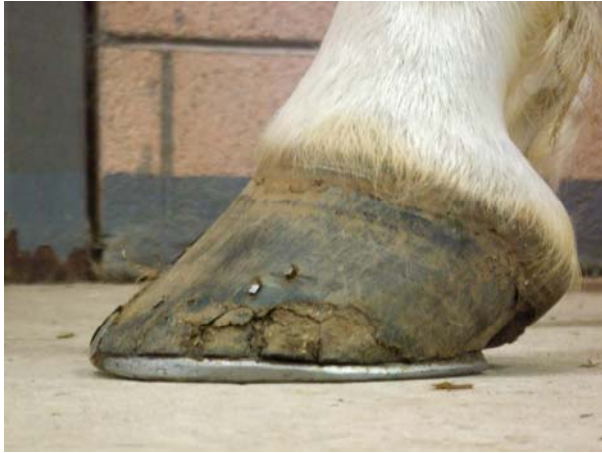
Eroded wall before trimming and shoeing