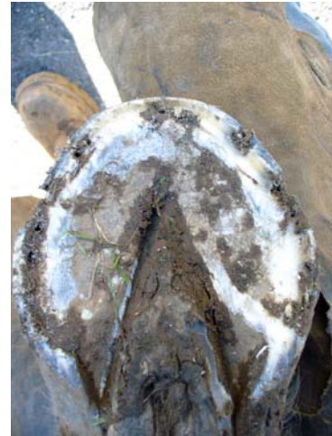
Hooves showing very little sound wall for nails to be driven into.

As I have already indicated, the wall wears naturally by the friction created by contact with the ground. Imagine what is happening to the hoof wall when, with every stride the