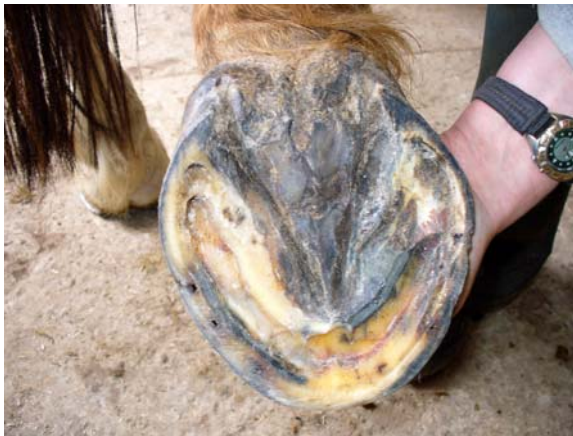
Puncture wound on a thin sole

The bars are a continuation of the wall whose function is to strengthen the heels and help shock absorption.