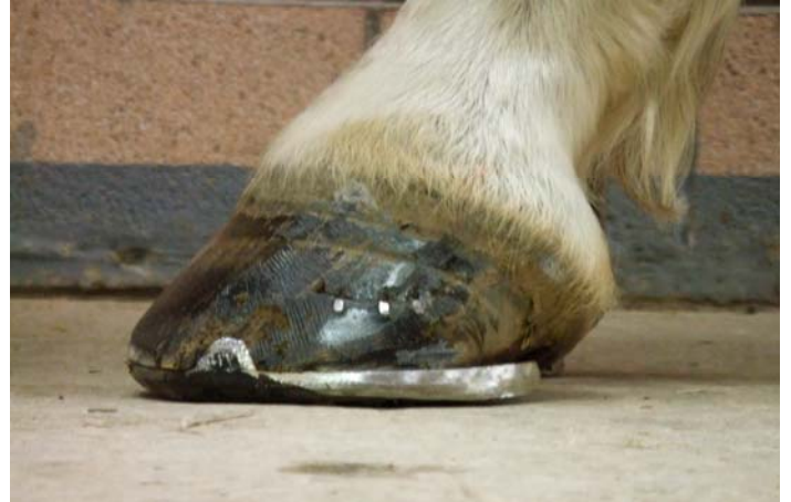
The same hoof after shoeing

Situated on either side just above the digital cushion are the collateral cartilages, whose function is supporting the coffin joint and shock absorption.