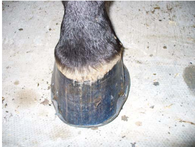
A good solid hoof

The outer hoof is made of horn which comprises carbon, hydrogen, nitrogen, oxygen and sulphur in various proportions. This horn surrounds a bone, called the pedal or coffin bone, which, in conjunction with the short pastern and navicular bones, forms the most distal joint of the limb, known as the coffin joint. The attachment of the hoof to the coffin bone is via a mesh of laminae.